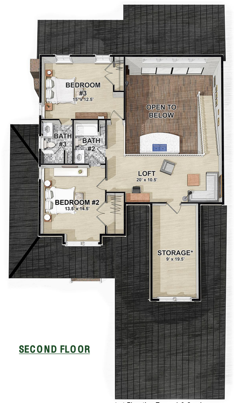
* at Elevation Types 1 & 2 only